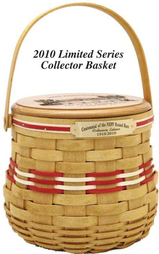
2010 Limited Series Collector Basket

The Centre Hall Women's Club is proud to present the "Crock" Basket to commemorate the Centennial of the NEFF Round Barn. The baskets are custom made exclusively by the American Traditions Basket Company in Canal Fulton, Ohio. Each basket is hand woven with expert craftsmanship. There will be a limited number of baskets made. Order your custom collector basket today!